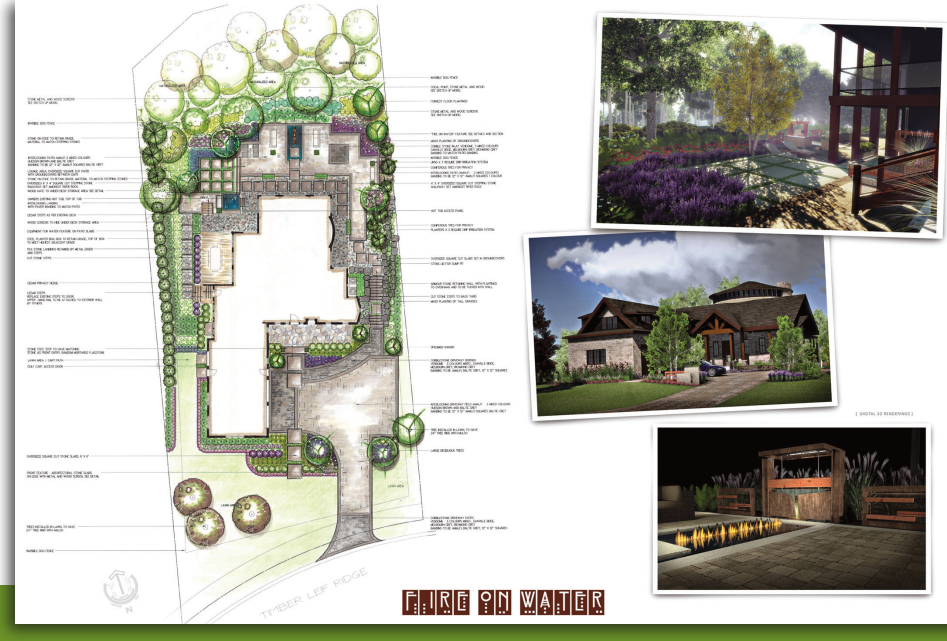
THE LANDMARK GROUP Private Residential Design 5000 sq ft