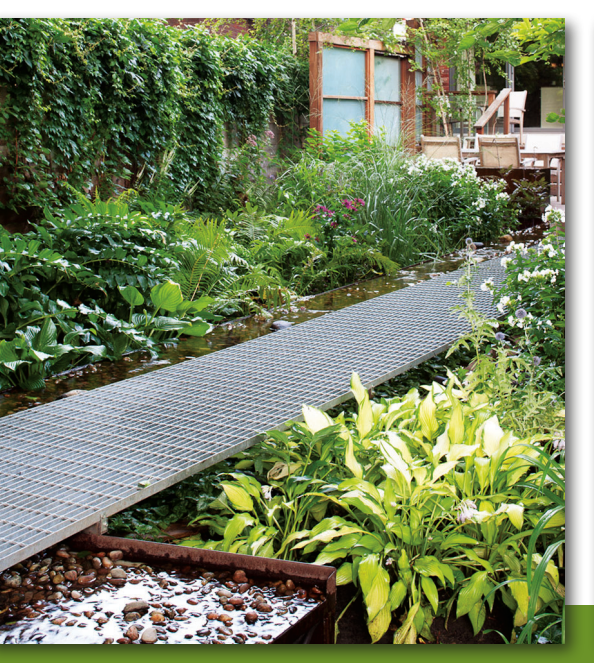
EARTH INCORPORATED Winner of the Casey van Maris Award

The Cultivated Garden Corporate Building Maintenance -Over 2 acres